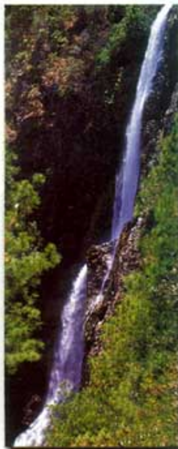
Hidden Valley Falls, Pine Ridge Forest Reserve in Cayo District, Belize.