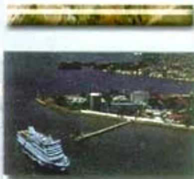
Ft. George cruise landing in Belize City, Belize.