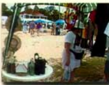
Souvenir shoppers at the Tourist village.

Have you ever wondered where the name Belize came from? The country was called Belize before the British colonized and renamed it British Honduras. En route to independence in 1973, the locals changed the name back to Belize. There are several theories for its meaning, many believe it stems from the mispronunciation of the named pirate Peter Wallace (pronounced wahl-EEZ) who roamed the high seas centuries ago and visited Belize. Another suggestion comes from the Maya word belix , which is reported to mean muddy river.