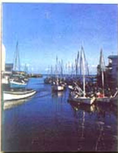
Local fishing boats anchored at the mouth of the Haulover Creek in Belize City.

The government of Belize passed Act No. 14 of 2000 to provide for the protection of patents in Belize; to repeal the Patents and Design Act, Chapter 212 of the Laws of Belize, Revised Edition