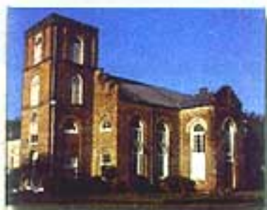
St. John's Cathedral in Belize City, said to be the oldest Anglican Church in Central America.

The Central Bank emphasized that none of the Reports and Surveys adversely affect Belize. The news media were urged to refrain from making misleading and alarming statements. And they were also informed that additional information on the Reports and Surveys could be obtained from the following websites: www.oecd.org/fatf , www.oecd.org and www.fsforum.org .